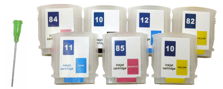
1 ½" Needle Clear Refill Friendly 10, 11, 12, 82, 84, and 85 Empty Cartridges